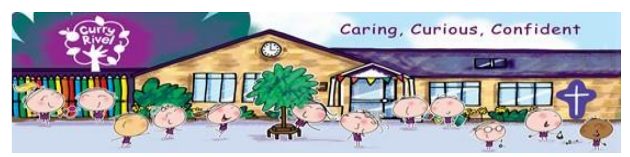
The Somerset Inclusion Tool - Valuing SEND

'Valuing SEND' was developed by three local authorities with schools, parent carers and IMPOWER. It is designed to help schools to better understand and meet the needs of their children with SEND, and to help them improve their whole-school SEND readiness. It will be used across Somerset schools moving forward and could make a real difference to children and young people in Somerset. Involvement of parent carers in using 'Valuing SEND' is absolutely key. There are two sessions for parent/carers which will take place next week with the Parent Carer Forum. If you have interested parent/carers, please register here - <a href="https://events.teams.microsoft.com/event/5d24e330-0e3e-463f-b2b0-c322f5165fb2@a44cf386-52d7-497f-85c3-687c8a966409">https://events.teams.microsoft.com/event/5d24e330-0e3e-463f-b2b0-c322f5165fb2@a44cf386-52d7-497f-85c3-687c8a966409</a>