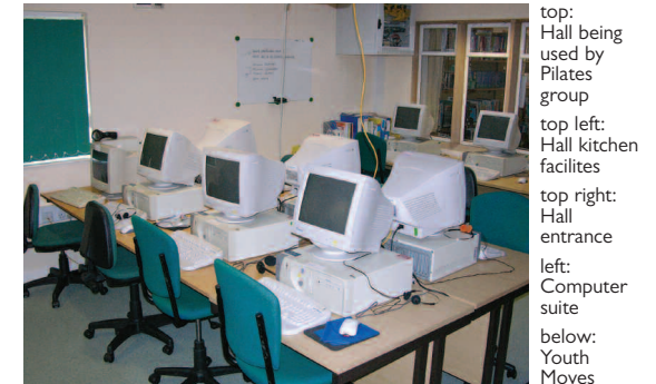
top: Hall being used by Pilates group top left: Hall kitchen facilities top right: Hall entrance left: Computer suite below: Youth Moves